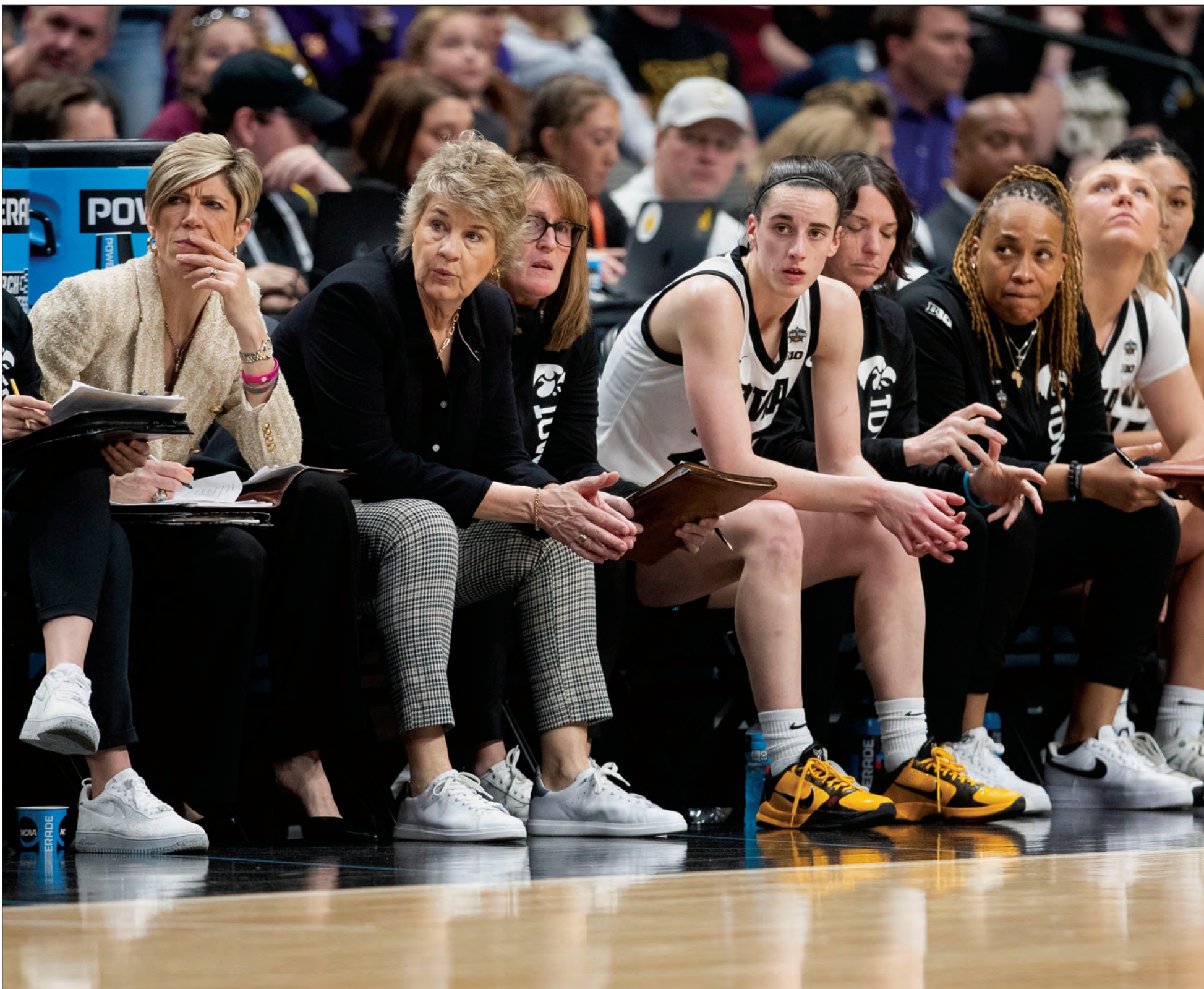
The Iowa's women's basketball team watches gameplay during the 2023 NCAA women's national championship game between No. 2 Iowa and No. 3 LSU at American Airlines Center in Dallas, Texas, on Sunday. The Tigers defeated the Hawkeyes, 102