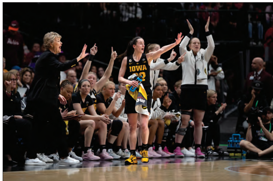
Iowa guard Caitlin Clark celebrates from the bench with her team during a 2023 NCAA women's Final Four game between No. 1 South Carolina and No. 2 Iowa at American Airlines Center in Dallas, Texas, on Friday. The Hawkeyes defeated the Gamecocks, 77-73, to advance to the National Championship Game.