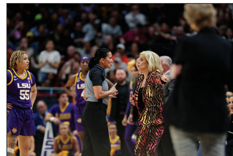
LSU head coach Kim Mulkey talks to a referee during the 2023 NCAA women's national championship game between No. 2 Iowa and No. 3 LSU at American Airlines Center in Dallas, Texas, on Sunday. The Tigers beat the Hawkeyes, 102-85.