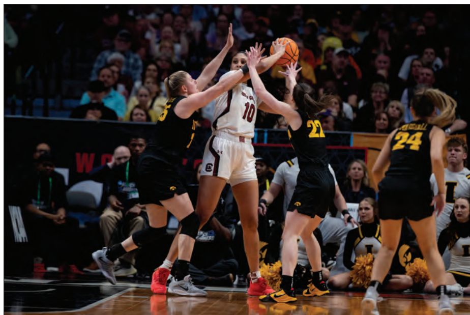
Iowa center Monika Czinano and Iowa guard Caitlin Clark surround South Carolina center Kamilla Cardoso during a 2023 NCAA women's Final Four game between No. 1 South Carolina and No. 2 Iowa at American Airlines Arena in Dallas, Texas, on Friday. The Hawkeyes defeated the Gamecocks, 77-73, to advance to the National Championship Game.