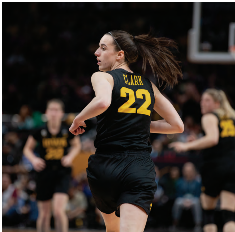
Iowa guard Caitlin Clark looks back during a 2023 NCAA women's Final Four game between No. 1 South Carolina and No. 2 Iowa at American Airlines Center in Dallas, Texas, on Friday. The Hawkeyes defeated the Gamecocks, 77-73, to advance to the National Championship Game.