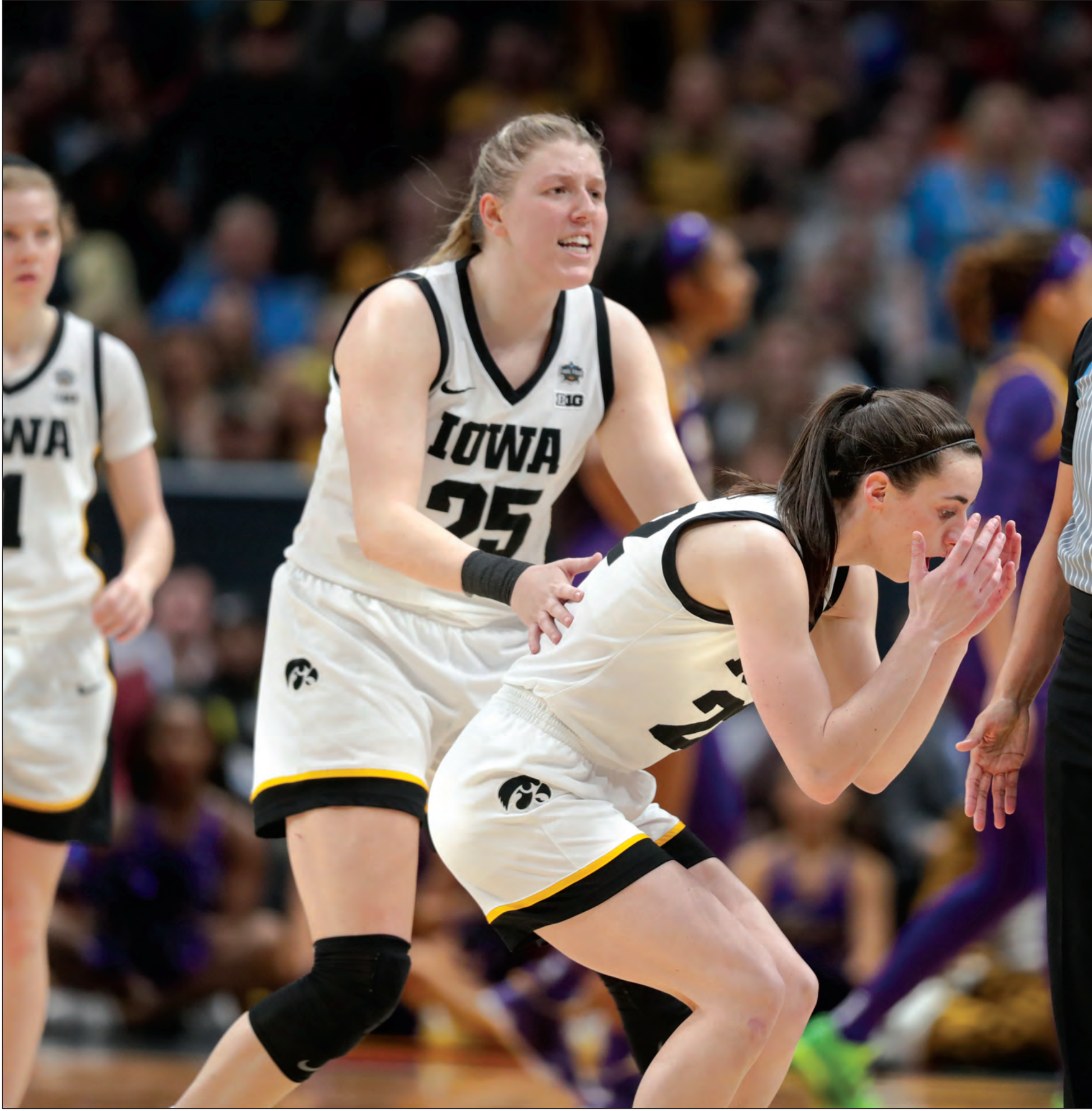
Iowa guard Caitlin Clark reacts to an official's call during the 2023 NCAA women's national championship game between No. 2 Iowa and No. 3 LSU at American Airlines Center in Dallas, Texas, on Sunday. The Tigers defeated the Hawkeyes, 102