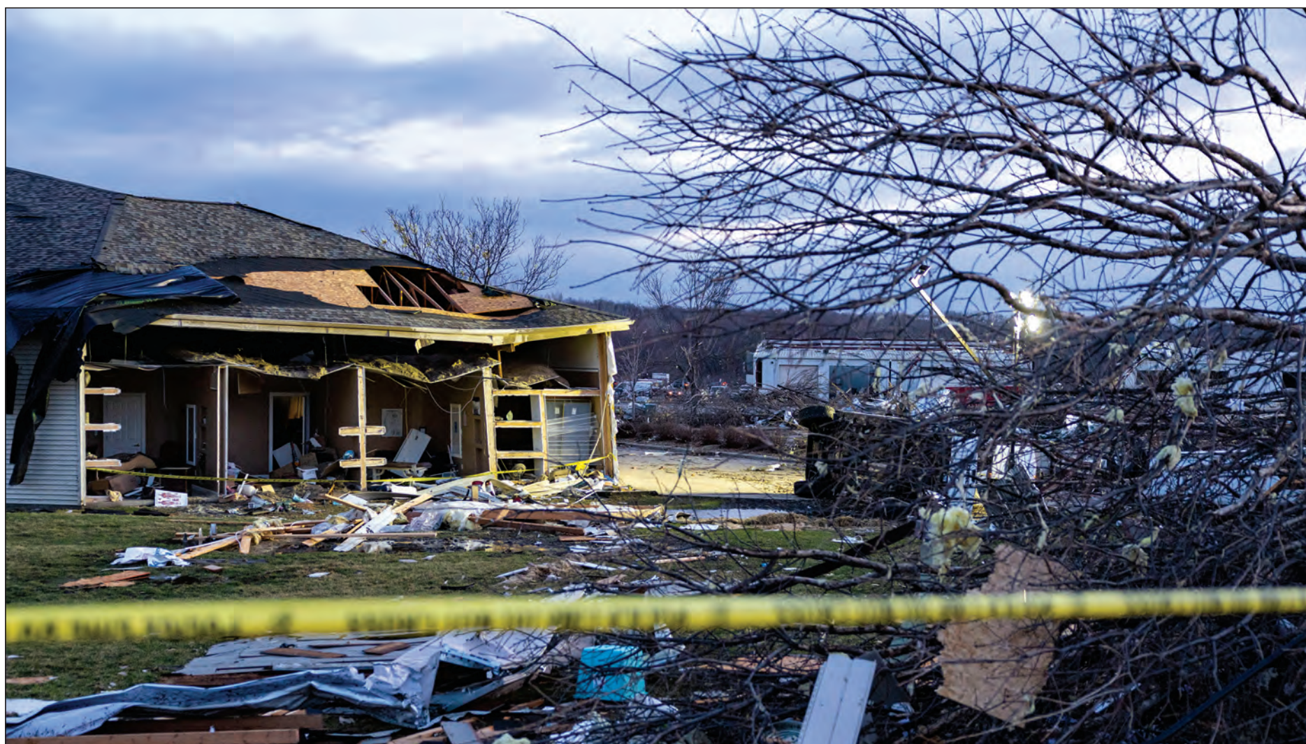
A wall is missing off the back of a building alongside Highway 6 after a tornado went through parts of Coralville on Friday. The Coralville fire and police departments worked alongside other agencies to help facilitate cleanup.