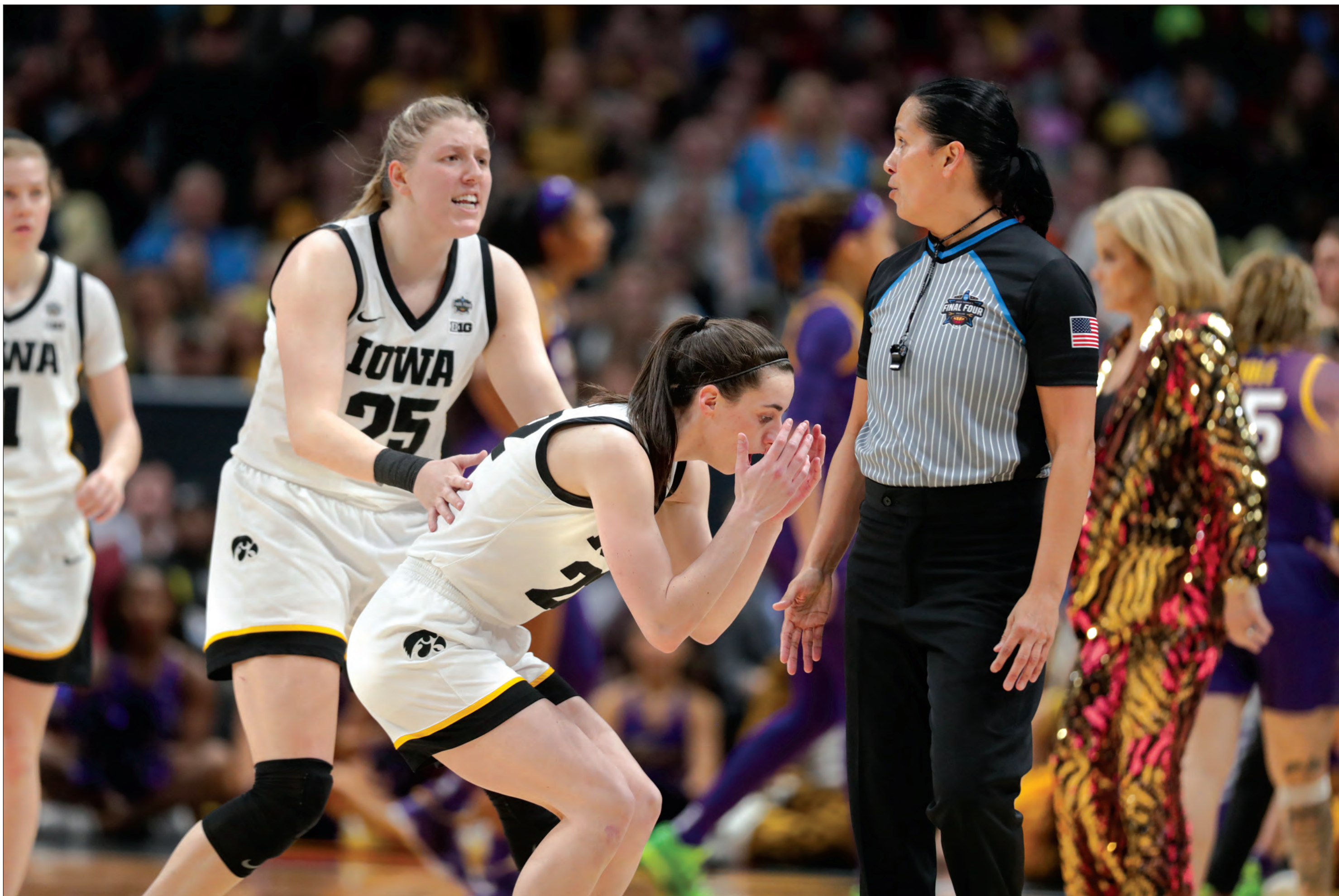
Iowa guard Caitlin Clark reacts to an official's call during the 2023 NCAA women's national championship game between No. 2 Iowa and No. 3 LSU at American Airlines Center in Dallas, Texas, on Sunday. The Tigers defeated the Hawkeyes, 102-85.