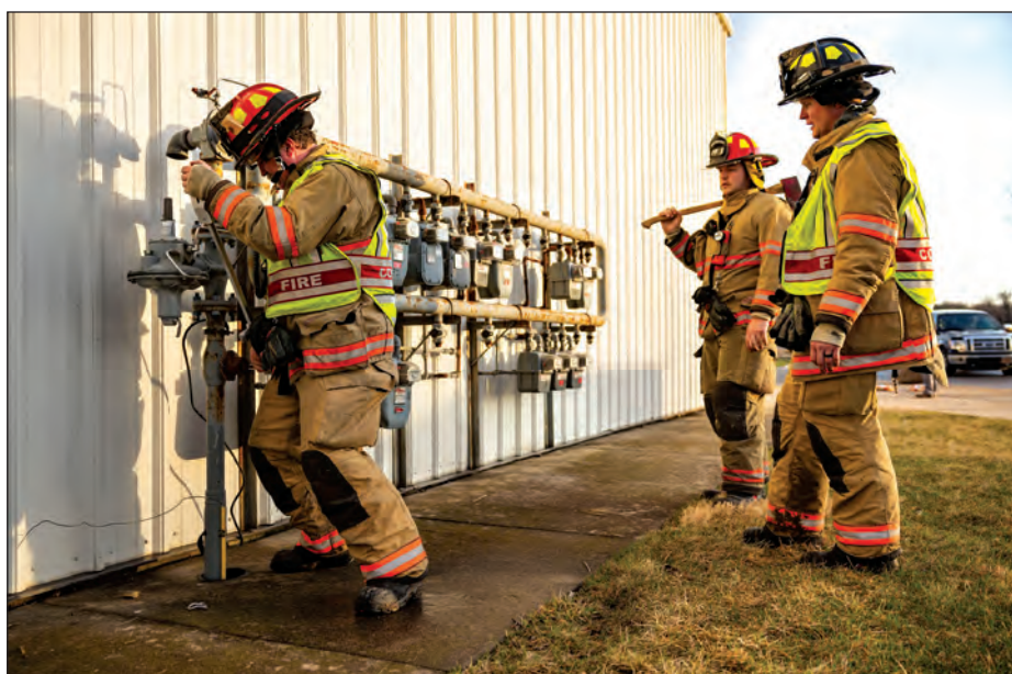
Coralville firefighters turn off gas lines after a tornado went through parts of the city on Friday. The Coralville fire and police departments worked alongside other agencies to help facilitate cleanup.