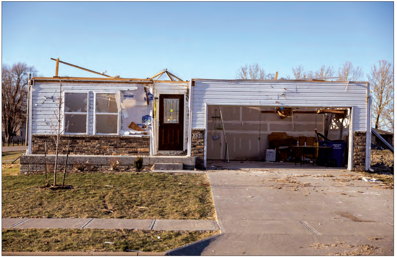
A damaged house is seen at the corner of Old Oak Ridge and Highway F62 in Hills, Iowa, on Saturday after a tornado went through parts of the town on Friday. The tornado impacted a new development in the city of 902 people.

Houses along Oak Ridge Avenue, a small Hills neighborhood off Highway F62, received the brunt of the impact. A house near the highway almost completely collapsed while its next-door neighbor's en-