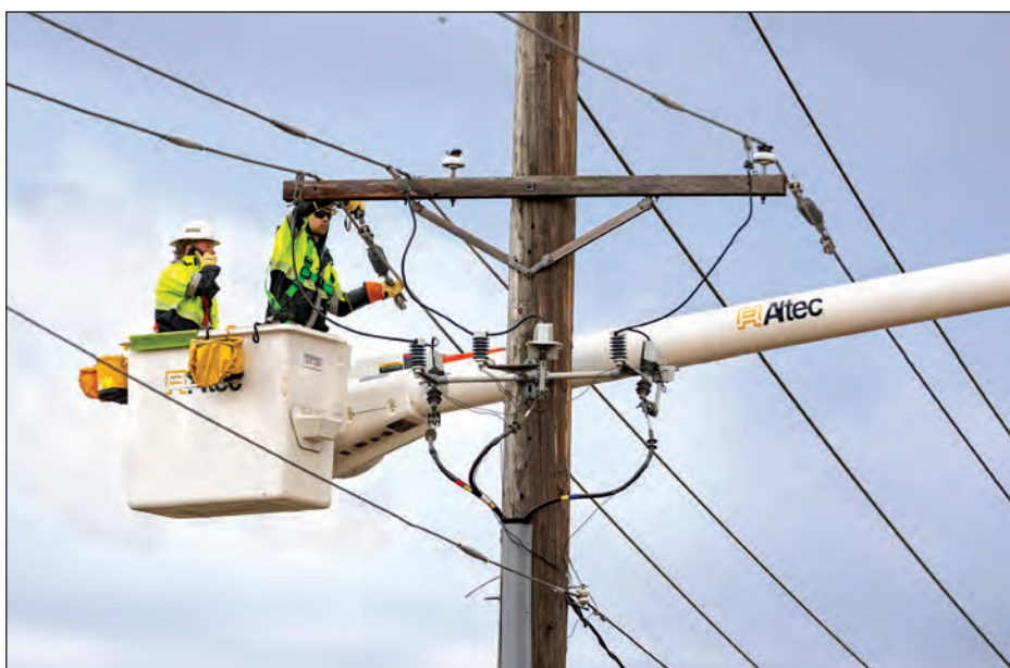
MidAmerican lineworkers fix electrical lines alongside Highway 6 after a tornado went through parts of Coralville on Friday. The Coralville fire and police departments worked alongside other agencies to help facilitate cleanup.

Community members from Coralville and Hills, Iowa, respond to Friday's tornado damage.