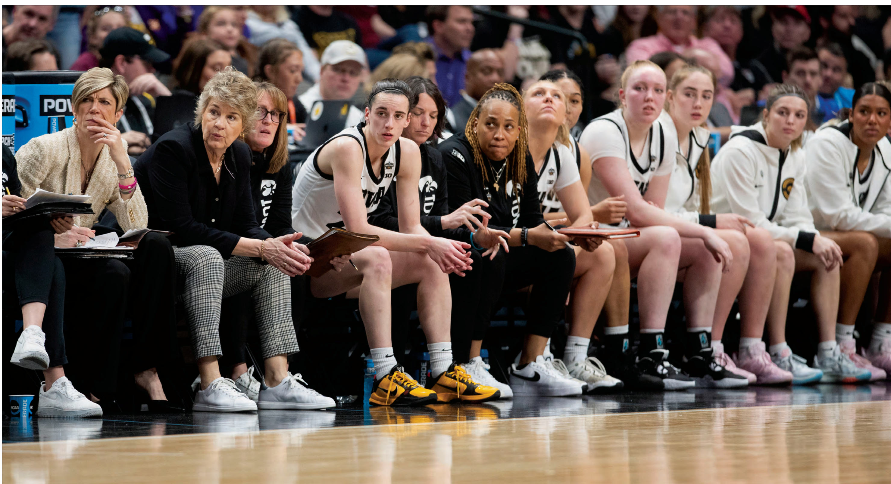
The Iowa women's basketball team watches gameplay during the 2023 NCAA women's national championship game between No. 2 Iowa and No. 3 LSU at American Airlines Center in Dallas, Texas, on Sunday. The Tigers defeated the Hawkeyes, 102-85.