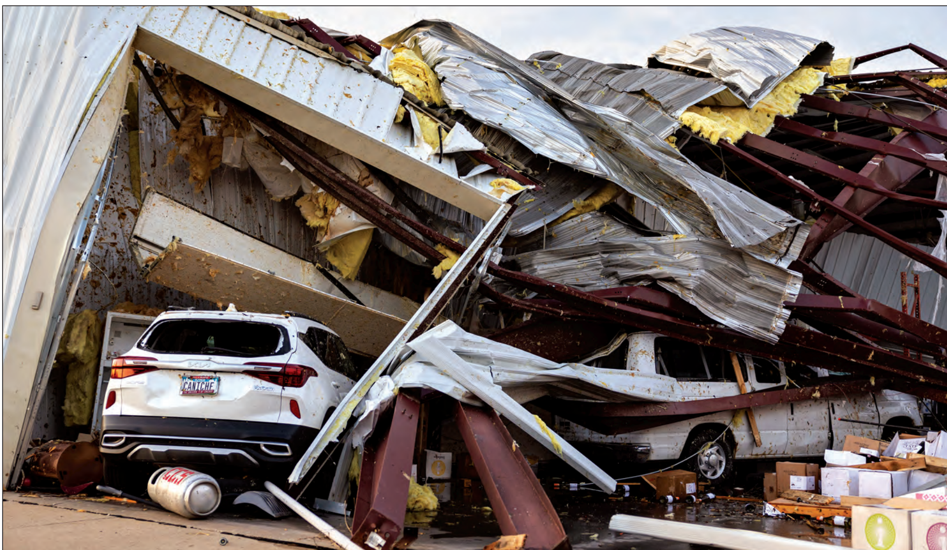
The roof of a business is seen on top of cars near Highway 6 in Coralville after a tornado went through parts of the city on Friday.