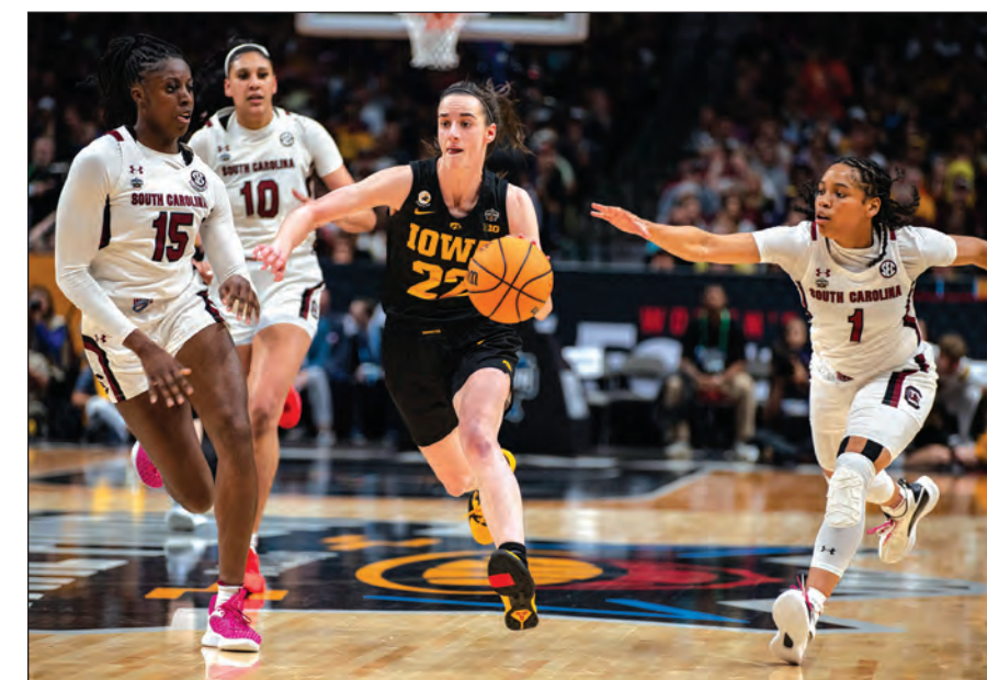
Iowa guard Caitlin Clark dribbles past defenders during the 2023 NCAA women's Final Four game between No. 1 South Carolina and No. 2 Iowa in Dallas, Texas, on Friday. The Hawkeyes defeated the Gamecocks, 77-73, to advance to the national championship game.