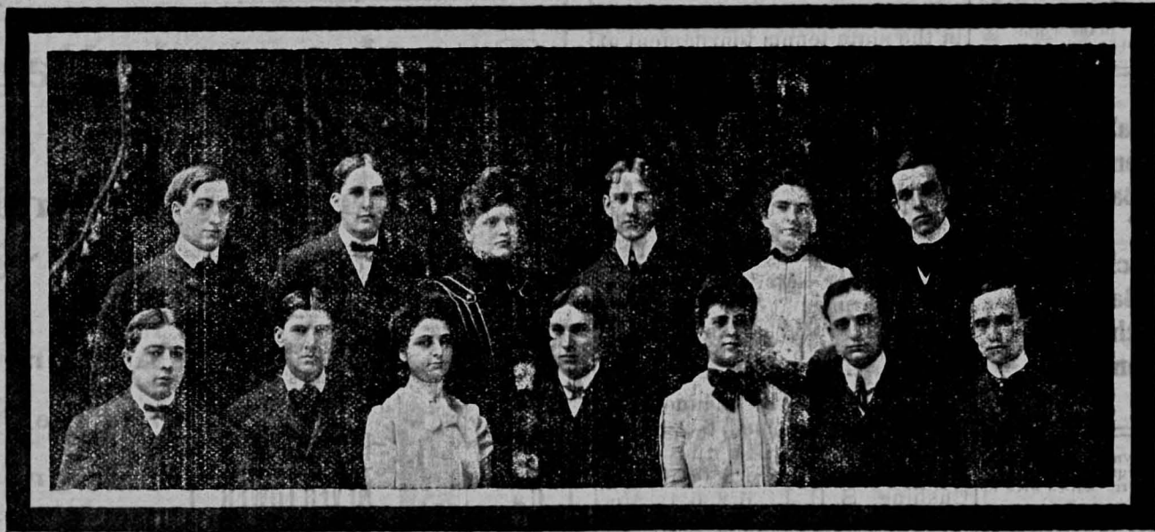
S. U. I. DRAMATIC CLUB, WHICH PRESENTS "HIS EXCELLENCY THE GOVERNOR" AT THE OPERA HOUSE TONIGHT