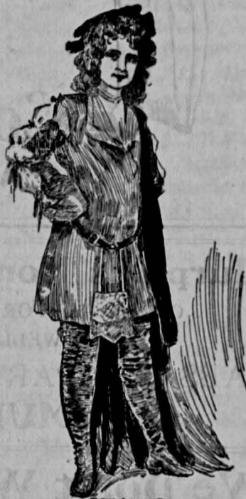
ROSALIND IN "AS YOU LIKE IT."

The advance seat sale for "As You Like It," which is to be presented tonight at the opera house has been large and indications are that the entertainment being given for the benefit of the athletic union will be well patron-