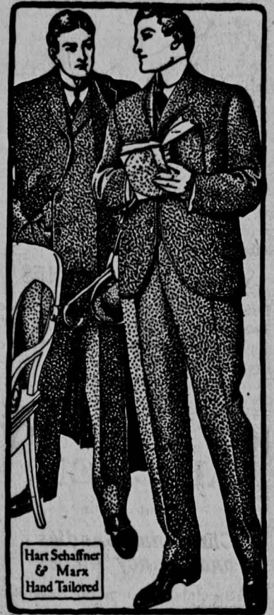
Hart Schaffner & Marx Hand Tailored