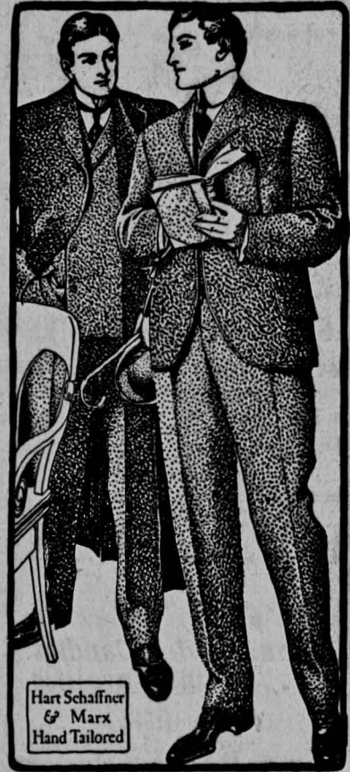
Hart Schaffner & Marx Hand Tailored