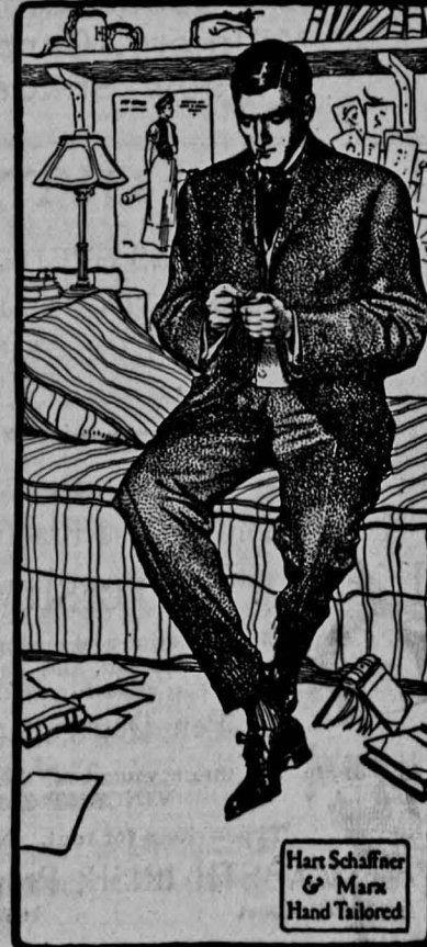
Copyright 1903 by Hart Schaffner & Marx