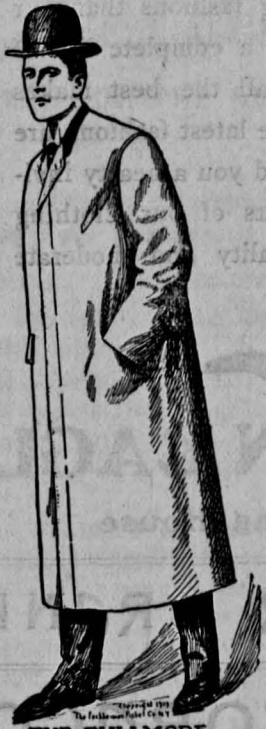
THE FULLMORE "EFF-EFF" FASHIONABLE CLOTHING

Our New Fall Suits are holding a reception and they earnestly request a call from you. You will find them in all the new styles, here ready to greet you.