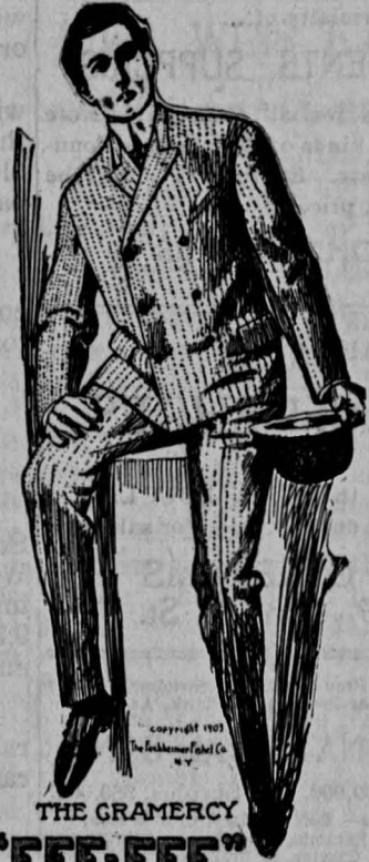
THE GRAMERCY "EFF-EFF" FASHIONABLE CLOTHING

We are sole agents for the Dunlap, Hawes, Roelof and Longley Hats, and the Monarch and Cluett Shirts.