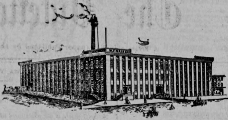
THE W. F. MAIN CO. FACTORY UNDER PROCESS OF COMPLETION AT IOWA CITY, IOWA. This Compered will be the Largest Jewelry Factory in the United States (containing over 55,000 feet of floor space) and the only one Located in the West.