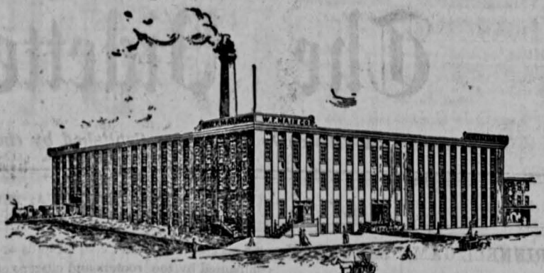
THE W. F. MAIN CO. FACTORY UNDER PROCESS OF COMPLETION AT IOWA CITY, IOWA. When Completed will be the Largest Jewelry Factory in the United States (containing over 55,000 feet of floor space) and the only one Located in the West.