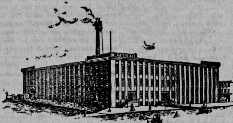
THE W. F. MAIN CO. FACTORY UNDER PROCESS OF COMPLETION AT IOWA CITY, IOWA. When Completed will be the Largest Jewelry Factory in the United States (containing over 55,000 feet of floor space) and the only one Located in the West.

Call on BLOOM & MAYER For Clothing and Hats.