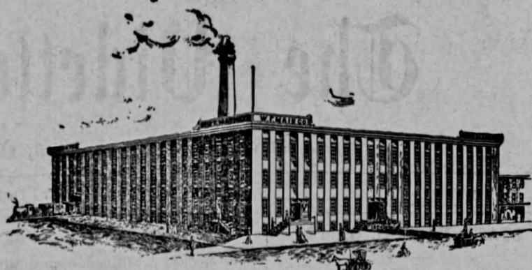
THE W. F. MAIN CO. FACTORY UNDER PROCESS OF COMPLETION AT IOWA CITY, IOWA. When Completed will be the Largest Jewelry Factory in the United States (containing over 55,000 feet of floor space) and the only one Located in the West.