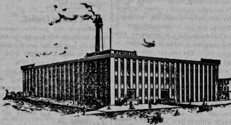
THE W. F. MAIN CO. FACTORY UNDER PROCESS OF COMPLETION AT IOWA CITY, IOWA. When Completed will be the Largest Jewelry Factory in the United States (containing over 55,000 feet of floor space) and the only one Located in the West.

CALL ON BLOOM MAYER FOR CLOTHING AND HATS.