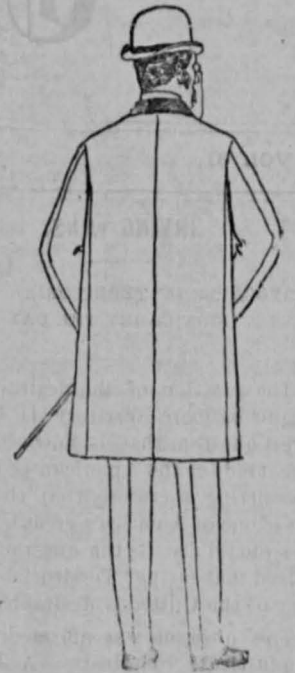
HALF BOX Copyright 1898 Fechheimer, Fausel & Co.