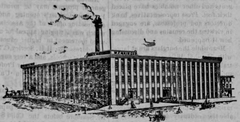
THE W. F. MAIN CO. FACTORY UNDER PROCESS OF COMPLETION AT IOWA CITY, IOWA. When Completed will be the Largest Jewelry Factory in the United States (containing over 55,000 feet of floor space) and the only one Located in the West.