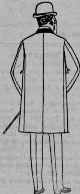
HALF BOX OVERCOAT Copyright 1898, Fechheimer, Fishel & Co.