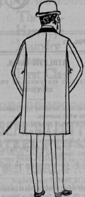
HALF BOX OVERCOAT Copyright 1898, Fechheimer, Eichel & Co.