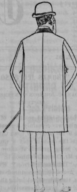
HALF BOX COATS Copyright 1898 Fechheimer, Finkel & Co.