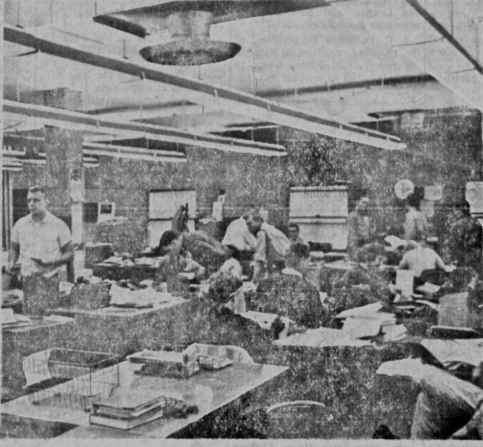
The Daily Iowan office is a beehive of activity as reporters hurry about preparing the next issue. Read your Iowan thoroughly; you'll enjoy the famous comics, Herbert Block's Washington Post editorial cartoons, editorial page commentary on local and national events and articles by top-notch staff writers of the Associated Press, United Press and the Herald Tribune News Service. Keep up with The University, Iowa City and the world by reading The Daily Iowan.