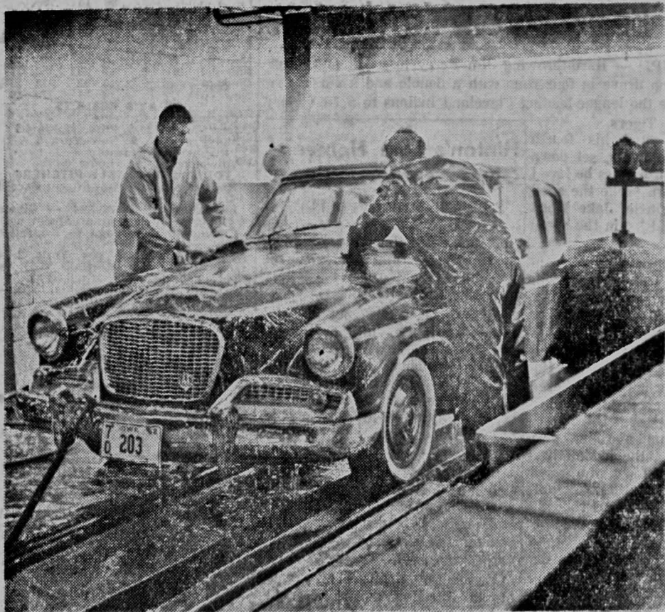
A 1960 Hawk is being given the advantage of a complete cleaning at Minit Automatic Car Wash , 1025 South Riverside Drive. The extremely reasonable price for this fast, thorough service is only $1.99, and by taking advantage of Minit's special Shell gasoline purchase, becomes as low as 99¢! Minit Automatic Car Wash is open for your convenience seven days a week.