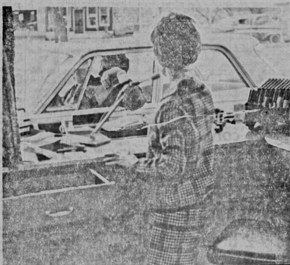
Modern Bankers realize the ease of banking from their car. Iowa State Bank and Trust Company has four drive-up and walk-up windows on the corner of Capitol and College streets just for your banking convenience. By making transactions this easy, modern way, you can come as you are; forget about the problem of parking. And you'll find the same friendly service as you do from their down town bank.