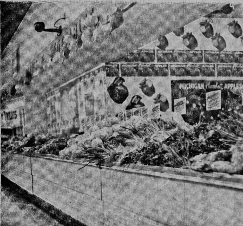
You'll like the large selection of fresh fruits and vegetables at Randall's Super Valu . All are rushed to Randall's so that they'll be as fresh as possible when you set them on the table. It's convenient to shop at Randall's because they are open every night and Sunday. Best of all, you get the midwest's lowest prices and Gold Bond Stamps with every purchase.