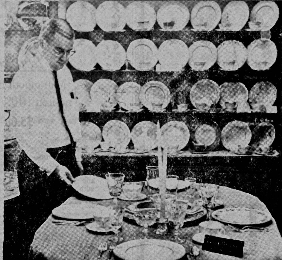
When you select your china, sterling and crystal, see Malcolm Jewelers for the finest. Malcolm's will set up your place settings on their table so you can see how nice it looks. In the line of china select from Royal Doulton or Pickard. For your sterling see our new patterns in Gorham, Wallace and International. Select your crystal from the many styles of Val St. Lambert.