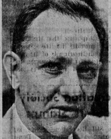
VANCE BOURJAILY Writes 'Confessions'

By W. G. ROGERS CONFESSION OF A SPENT YOUTH. By Vance Bourjaily. Dial. $4.95. What is the stuff in a man? Where does it come from, how does he assimilate it? Or maybe this is the question: What added to what added to what and so on makes a man?