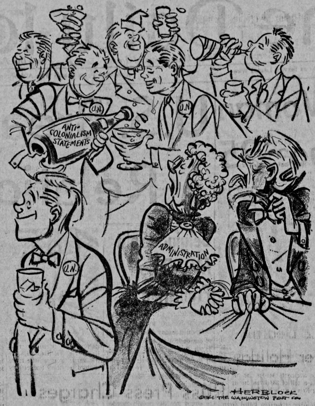
"My Boy Is An Abstainer."

MEMBER OF THE ASSOCIATED PRESS The Associated Press is entitled exclusively to the use for republication of all the local news printed in this newspaper as well as all AP news dispatches.