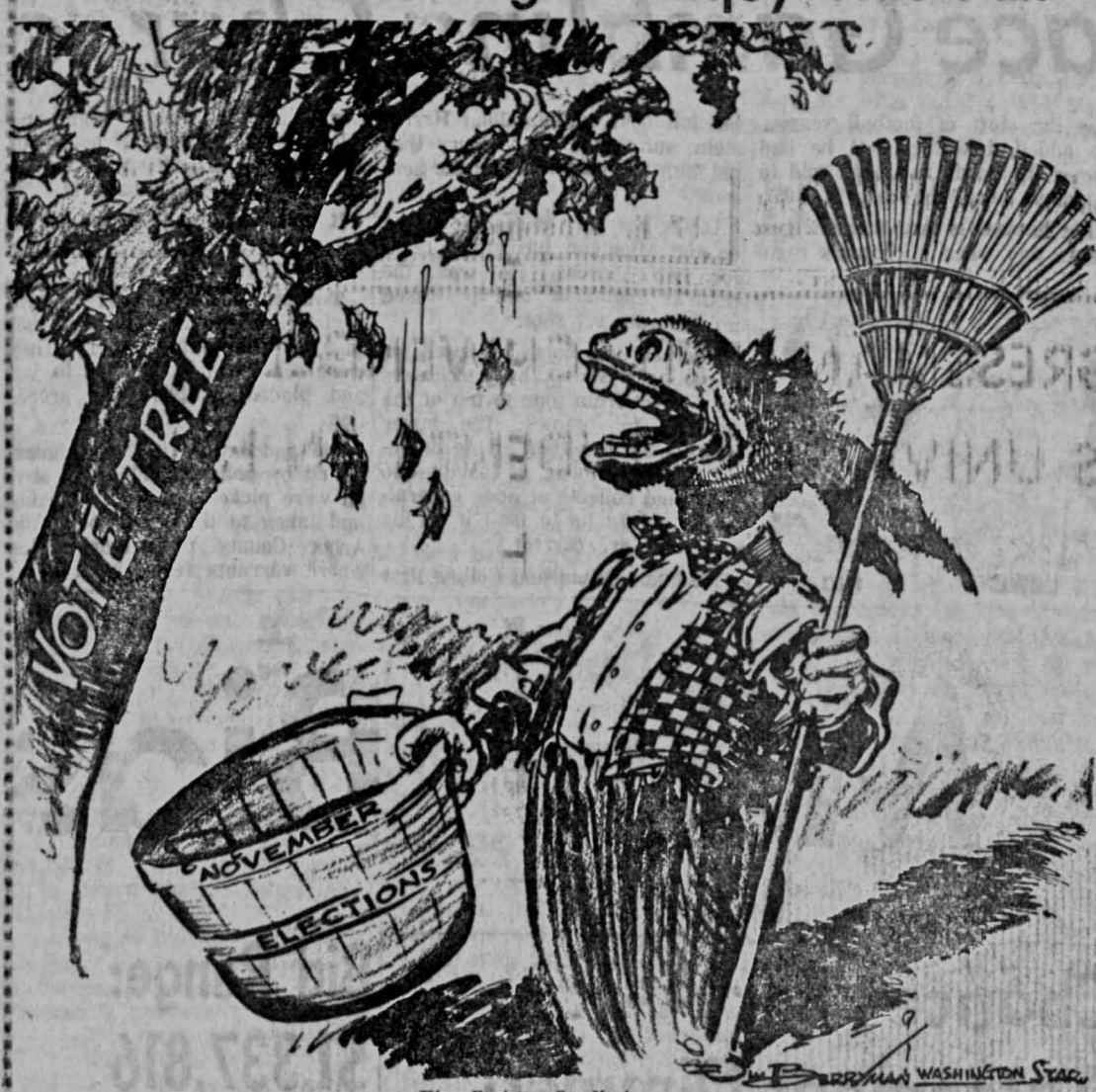
King Features Syndicate