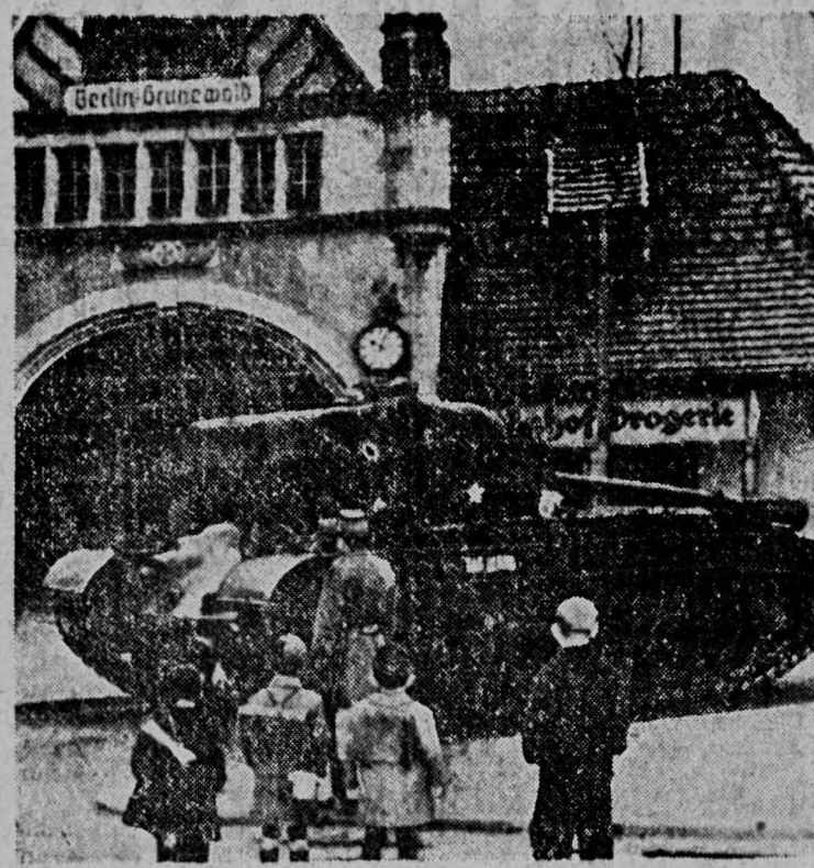
GOING TO SCHOOL, young German children stop to gaze in awe at an American Pershing tank rolling out of Berlin's Grunewald station. It is one of 22 heavy tanks equipped with 90 mm. guns shipped to Berlin to reinforce the U.S. Sixth infantry regiment. The tanks were delivered at night through the Soviet zone aboard covered flatcars. There were no incidents.