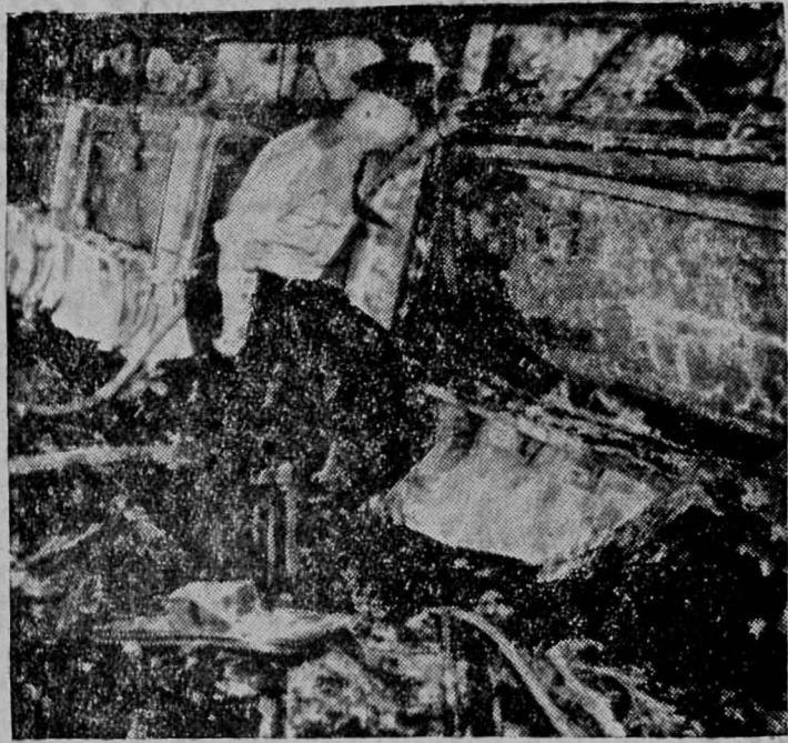
Inspects Ruins of Car in Which Two Died Telephone Operator Said 'We Have Had a Terrible Accident'

KREMLIN, OKLA. (AP)—A speeding Rock Island streamliner plunged from the tracks here yesterday, killing at least two persons and injuring 42 more as it crashed into freight cars on a side track. The passenger train, the Texas Rocket, was struck by a dump truck as it sped southward at nearly eighty miles an hour. The three coaches of the train were derailed by the impact, careened down the right-of-way, smashed into the freight train and caught fire. The state highway patrol said two persons were killed and 27 more hospitalized, five of them in critical condition. The patrol said 15 others were treated for less serious injuries and released. The patrol said the bodies were so badly mangled and burned it was not possible to say for certain whether two or three persons died in the charred coach. The injured were taken to hospitals in Enid, 12 miles south of this town of 100 in northwestern Oklahoma's wheatlands. The left sides of the three coaches were ripped off. Two caught fire. The coach hit by the