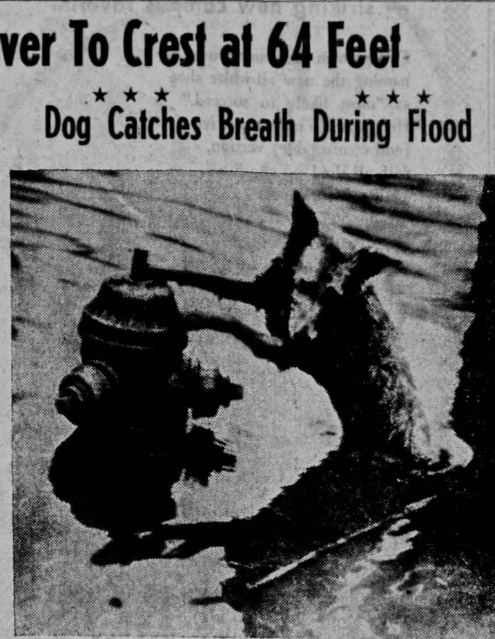
AS THE OHIO RIVER ROSE four feet above flood level in Wheeling, W. Va., a mongrel dog, "Skipper", stopped at a fire plug to catch his breath.

AS THE OHIO RIVER ROSE four feet above flood level in Wheeling, W. Va., a mongrel dog, "Skipper", stopped at a fire plug to catch his breath.