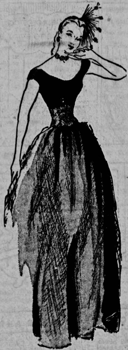
Sophisticated net and chiffon formals designed with bewitching bodices and billowing skirts—accented by wide sparkling belts.

We can't answer that . . . but we can assure you of this . . .