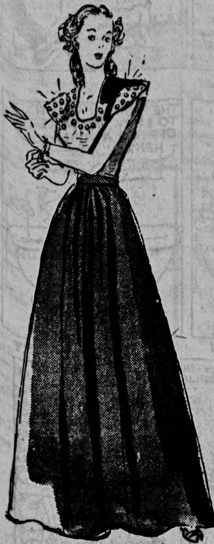
It's no secret that you will capture his admiration . . . and his heart . . . if you look your loveliest at the Military Ball in an enchanting new formal from our fine collection. See our many new formals in all the latest styles today!