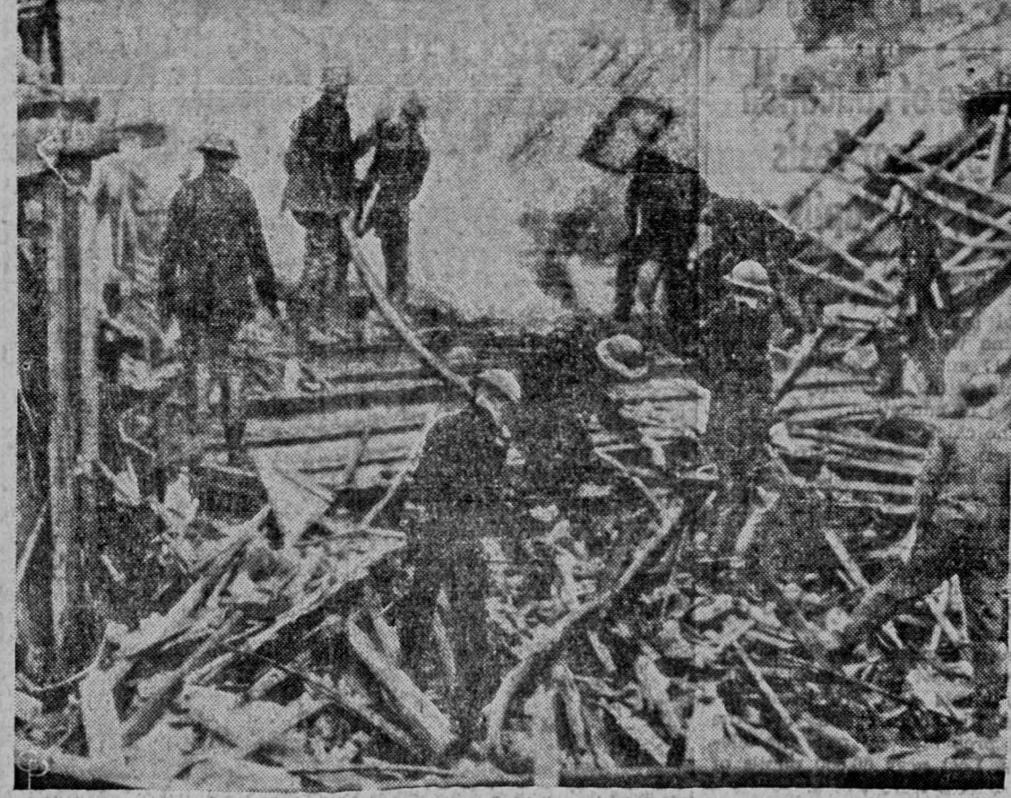
BRITISH FIREMEN COMB RUINS for victims as they fight fire set by explosions of one of the Nazis' dreaded V-2 rocket bombs. The terror weapon inflicted heavy casualties and property damage when it struck in a South England residential town.