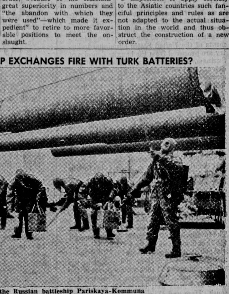
Aboard the Russian battleship Pariskaya-Kommuna According to a broadcast from the Nazi-controlled radio station in the Netherlands, a Russian battleship, believed to be the Pariskaya-Kommuna, aboard which the above picture was taken...