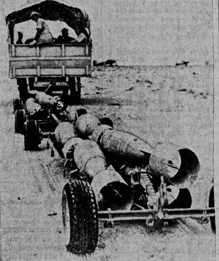
Dollies loaded with aerial bombs are towed by truck across the hot sands of the Egyptian desert to be loaded into bombers of the British RAF operating from desert bases.