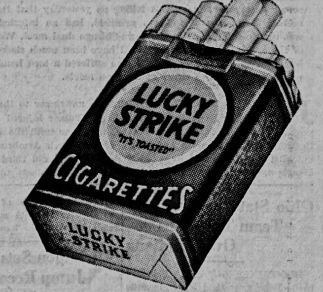
THE FINEST TOBACCO— "THE CREAM OF THE CROP"

An independent survey was made recently among professional men and women—lawyers, doctors, lecturers, scientists, etc. Of those who said they smoke cigarettes, more than 87% stated they personally prefer a light smoke . Mr. Cooper verifies the wisdom of this preference, and so do other leading artists of the radio, stage, screen and opera. Their voices are their fortunes. That's why so many of them smoke Luckies. You, too, can have the throat protection of Luckies—a light smoke, free of certain harsh irritants removed by the exclusive process "It's Toasted". Luckies are gentle on the throat.