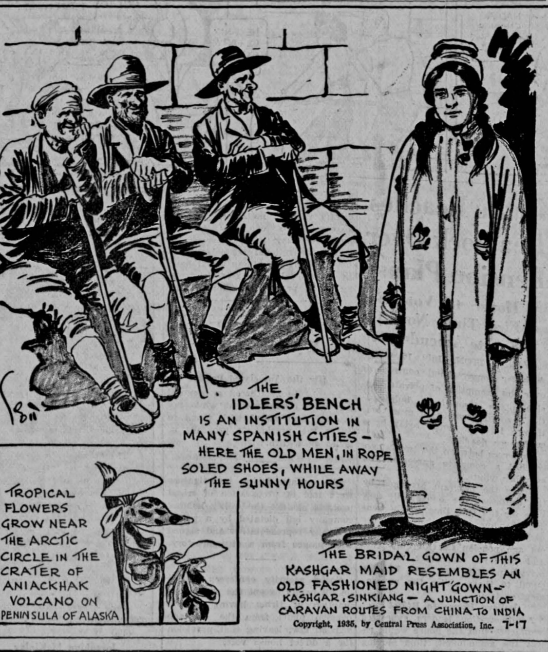
THE IDLERS' BENCH IS AN INSTITUTION IN MANY SPANISH CITIES - HERE THE OLD MEN, IN ROPE SOLED SHOES, WHILE AWAY THE SUNNY HOURS