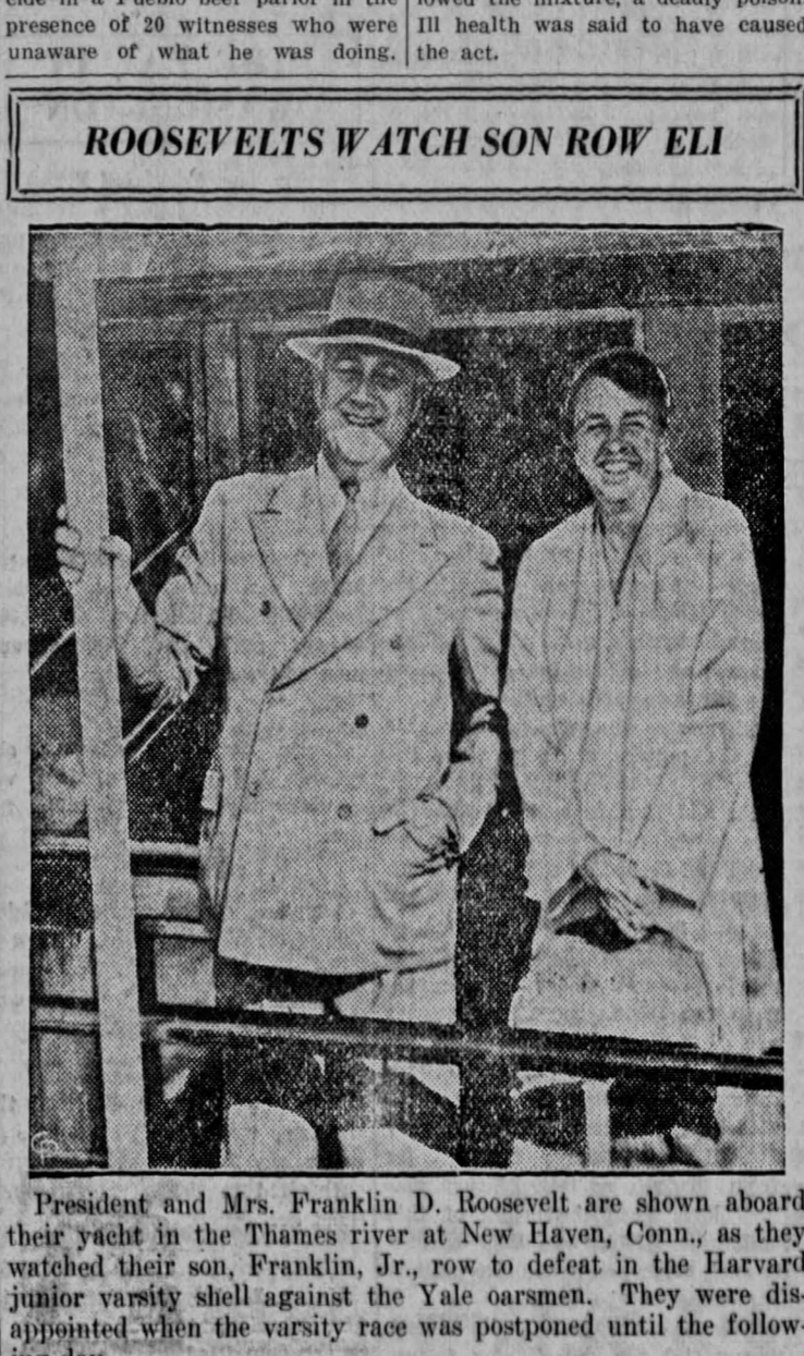
President and Mrs. Franklin D. Roosevelt are shown aboard their yacht in the Thames river at New Haven, Conn., as they watched their son, Franklin, Jr., row to defeat in the Harvard junior varsity shell against the Yale oarsmen.