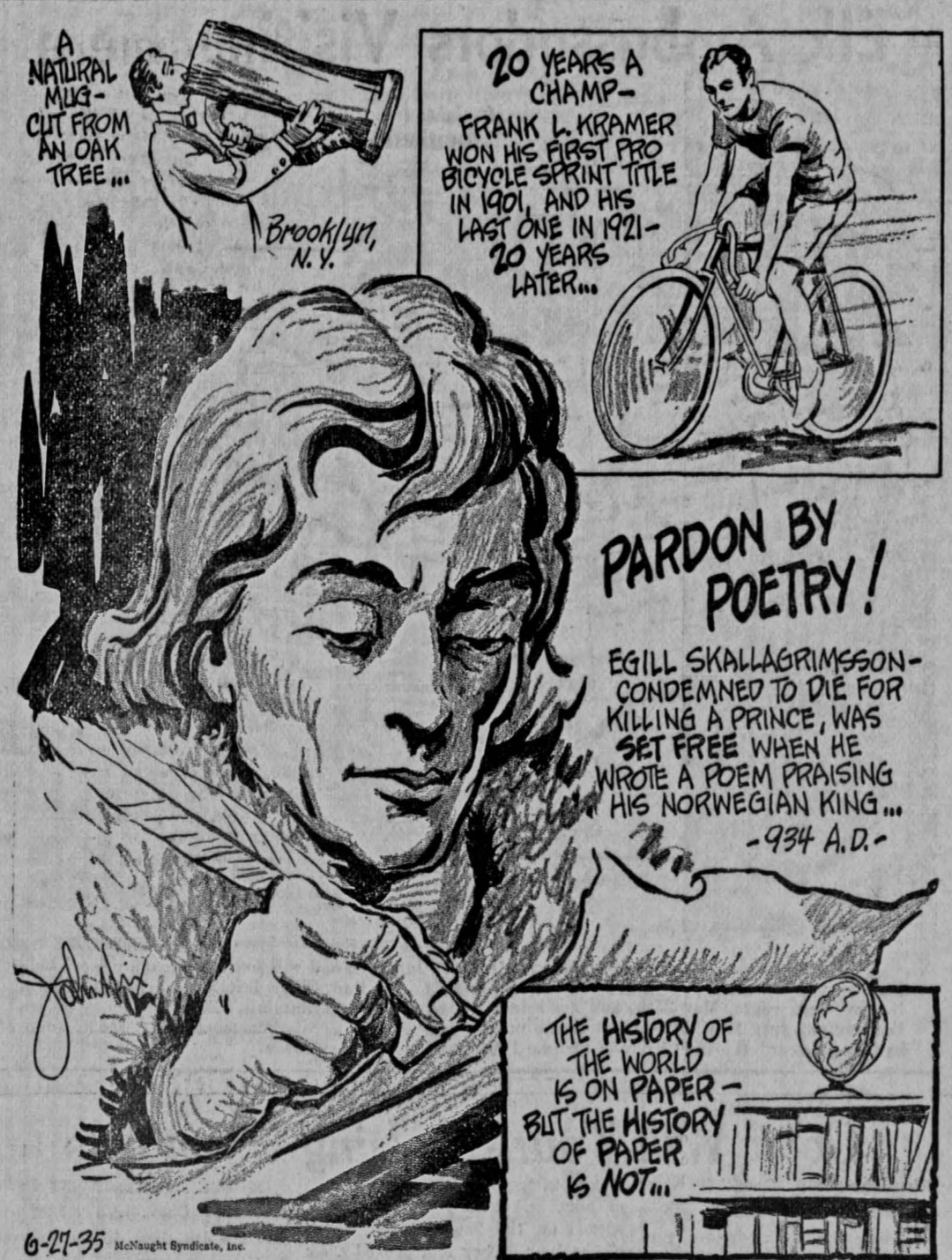
See Page 5 for Explanation of Strange As It Seems

For Further Proof Address The Author, Enclosing a Stamped Envelope For Reply. Reg. U. S. Pat. Office