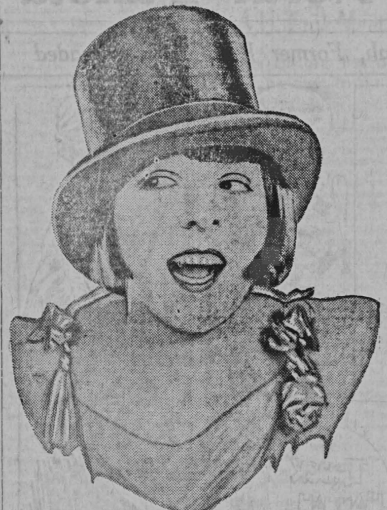
Colleen Moore, whose latest picture, "We Moderns," is now showing.