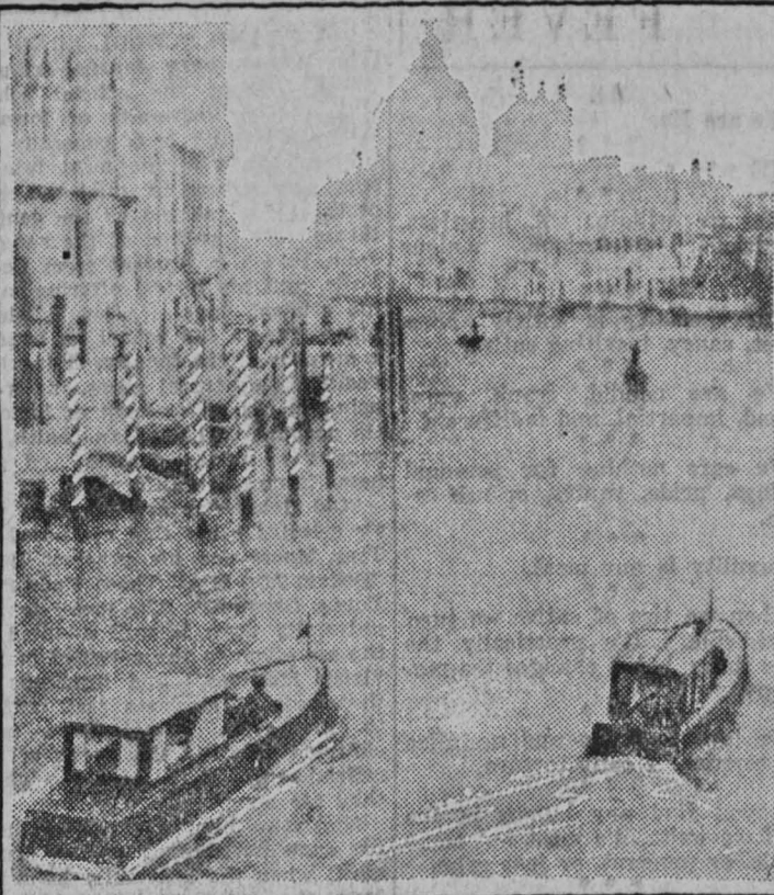
Motor "taxis" are replacing the picturesque gondolas on canals of Venice, as photo shows. Gondolas still are in favor with romantic tourists, but Venetians are taking to the new craft as a means of getting about quickly.

of our government, why will they have it for another statute? The eighteenth amendment will have to be respected just like all the other laws, before we can say that there is less criminality.