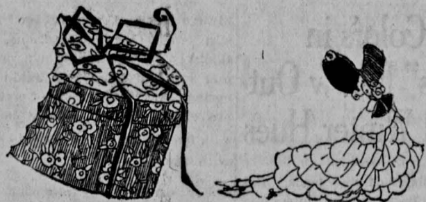
From Milady's Hat-box

The display of spring merchandise will intrigue, the kaleidoscope of colors will dazzle, and the illuminated floats of Mecca will charm.