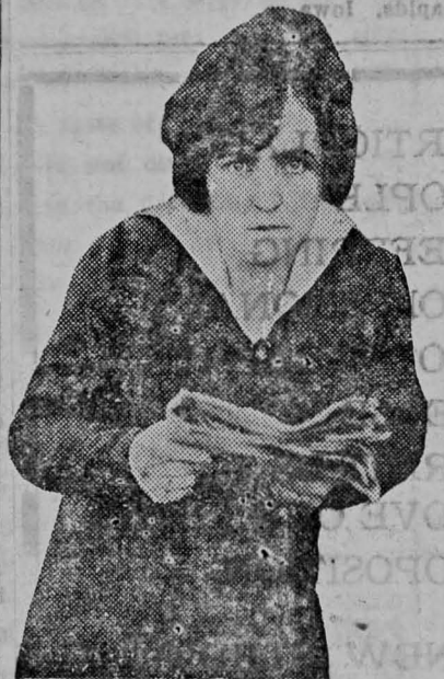
Her Eyes Filled With a Mingling of Triumph and Hatred.