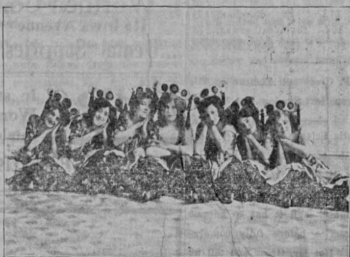
"Ponies" in the Flower of the Ranch at the Coldren Theatre next Tuesday evening.