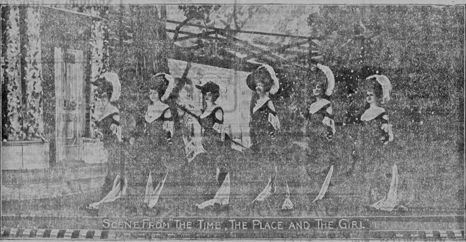
SCENE FROM THE TIME, THE PLACE AND THE GIRL

Reichardt :: :: The Confectioner Palmetto Chocolates our specialty : All candies home made : Ice Cream made in all shapes and furnished for parties and receptions : All latest drinks :: :: ::