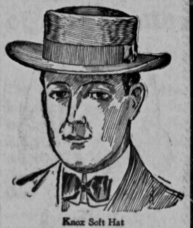
Knox Soft Hat